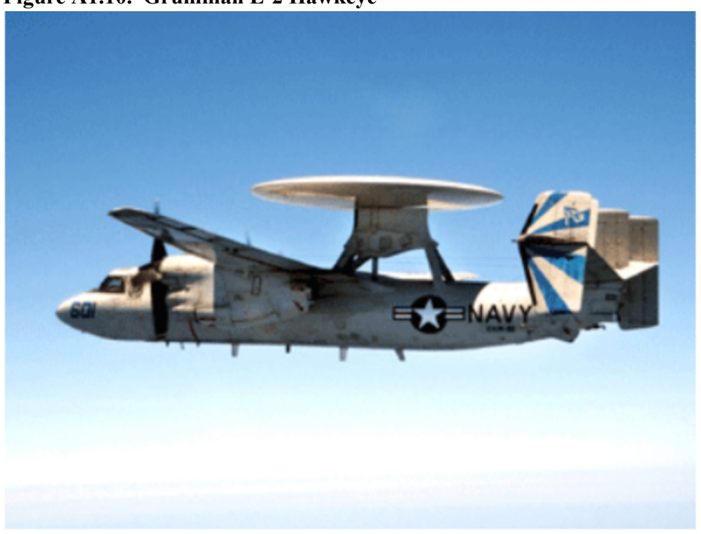
Table A1.10. E-2 Information

Description: Two engine, turboprop airborne warning and control platform