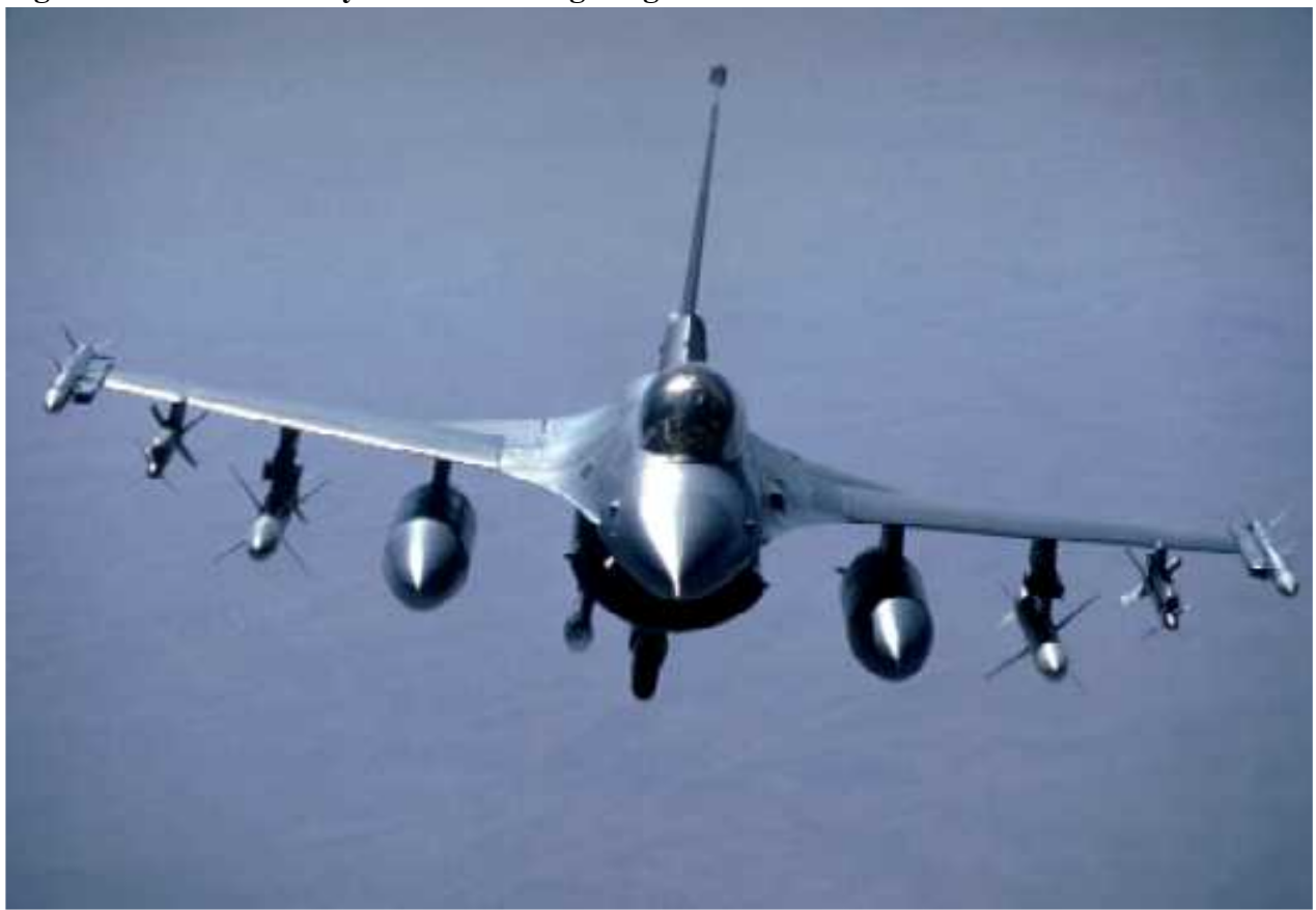
Figure A1.4. General Dynamics F-16 Fighting Falcon