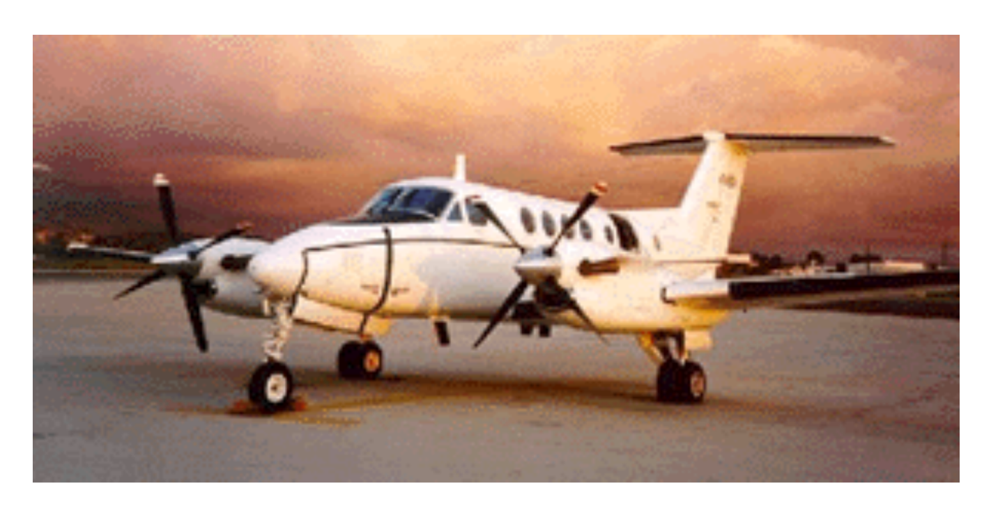
Figure A1.9. Beech C-12 Huron