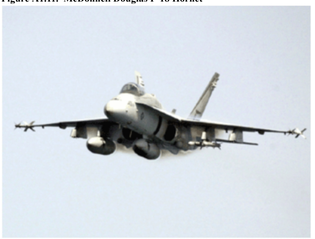
Table A1.11. F-18 Information

Description: Two engine, turbofan fighter