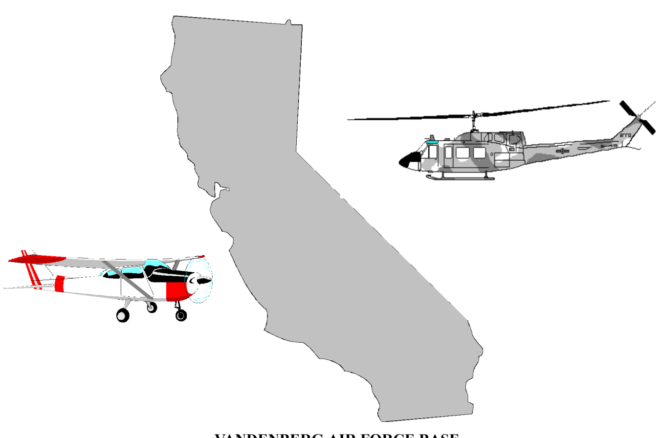
VANDENBERG AIR FORCE BASE AND THE CENTRAL COAST