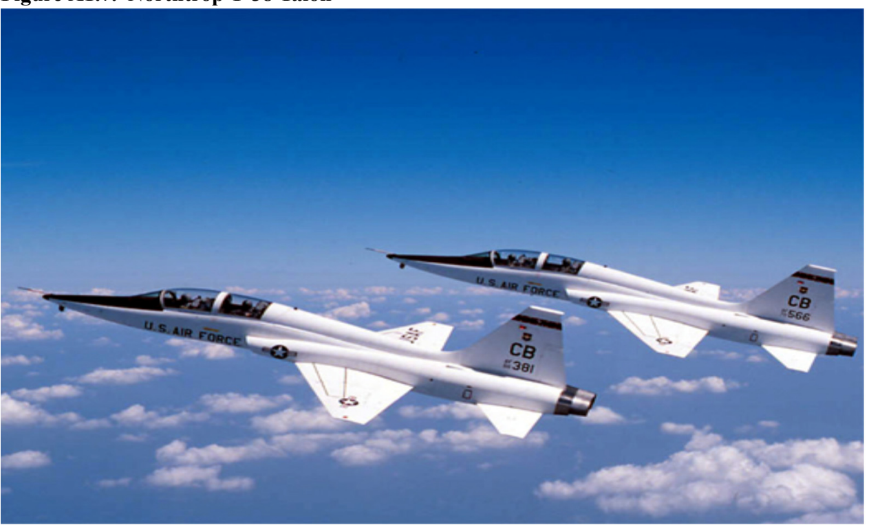
Figure A1.7. Northtrop T-38 Talon