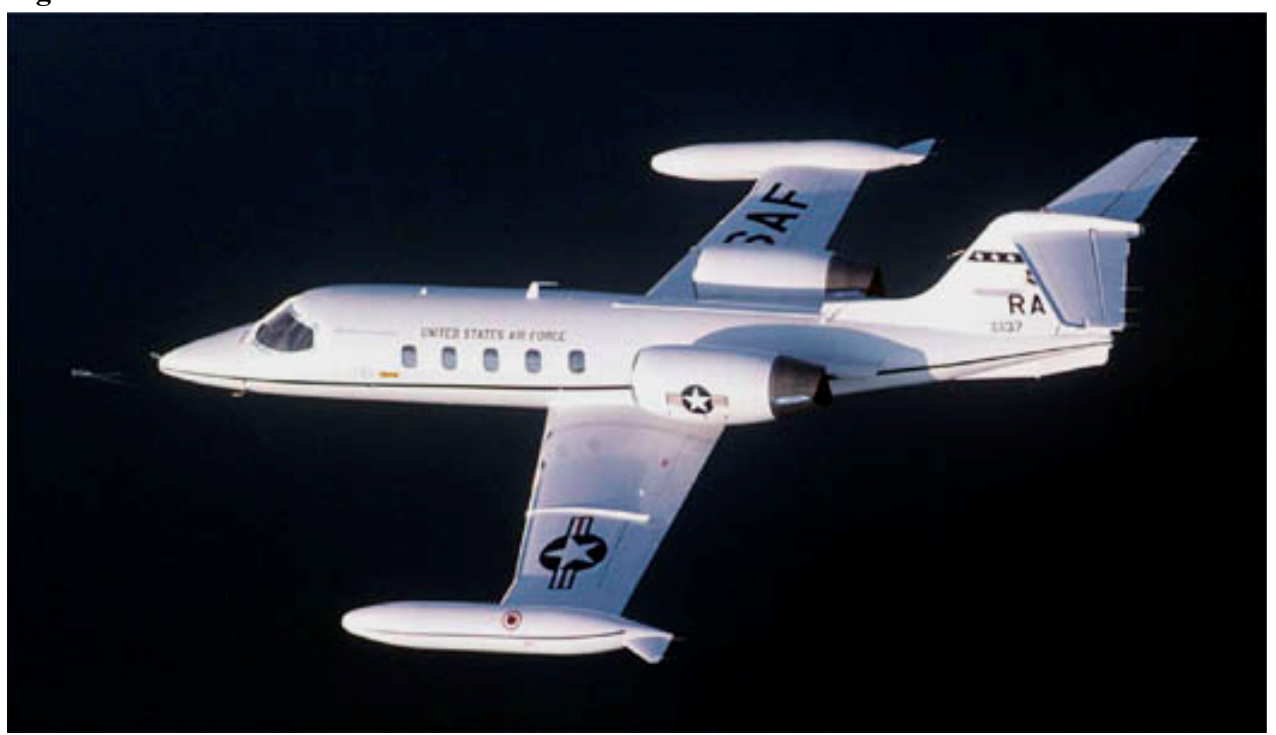
Figure A1.2. Lear C-21A