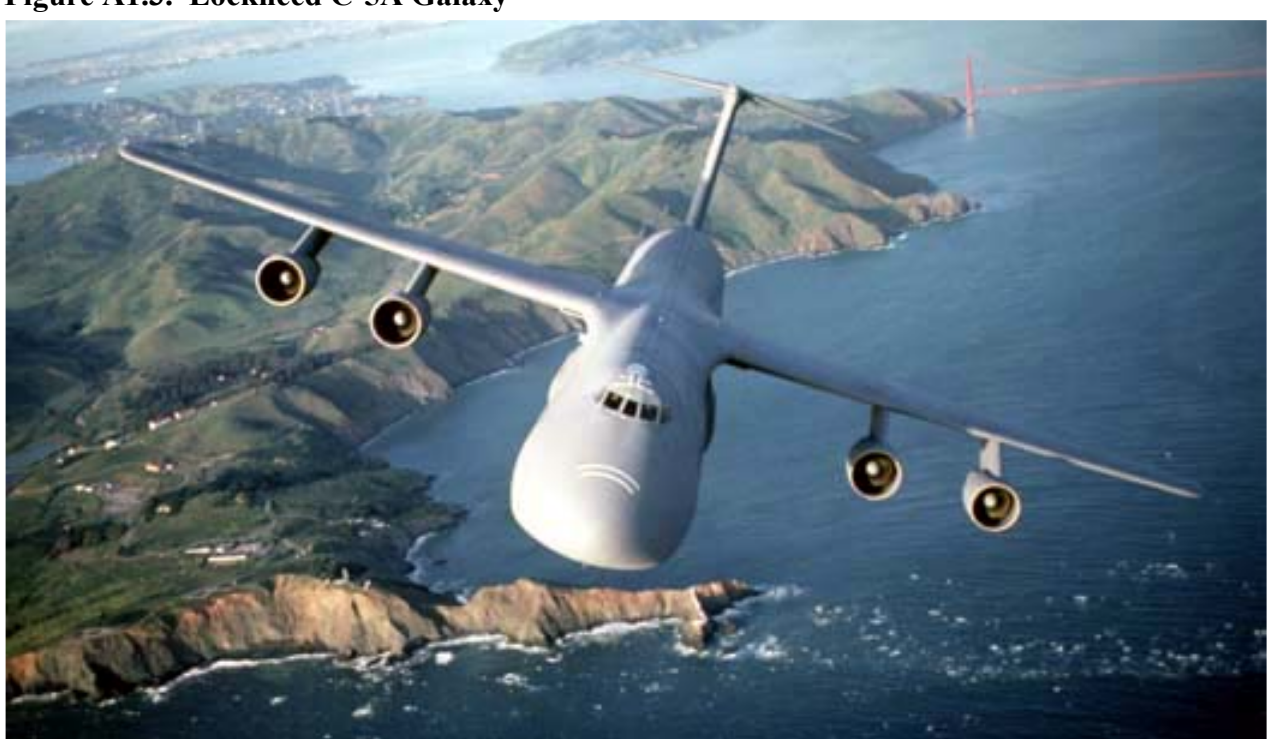
Figure A1.3. Lockheed C-5A Galaxy