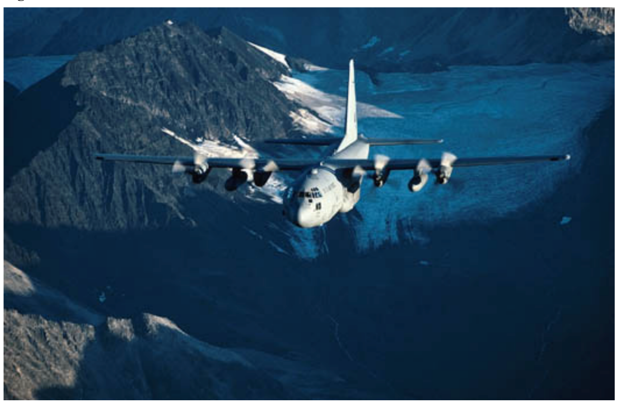
Figure A1.5. Lockheed C-130 Hercules