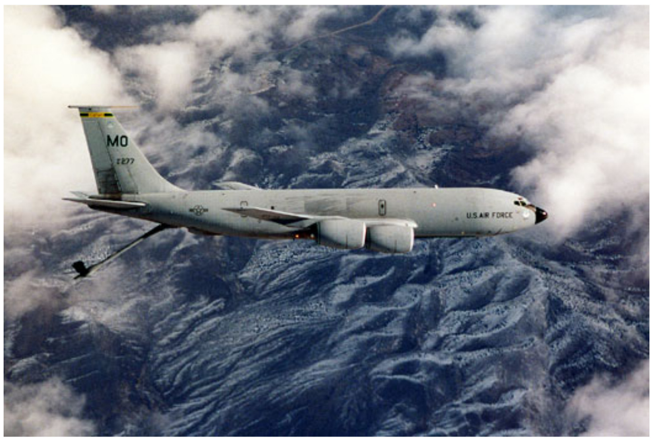
Table A1.8. KC-135 Information

Description: Four engine, turbofan refueler