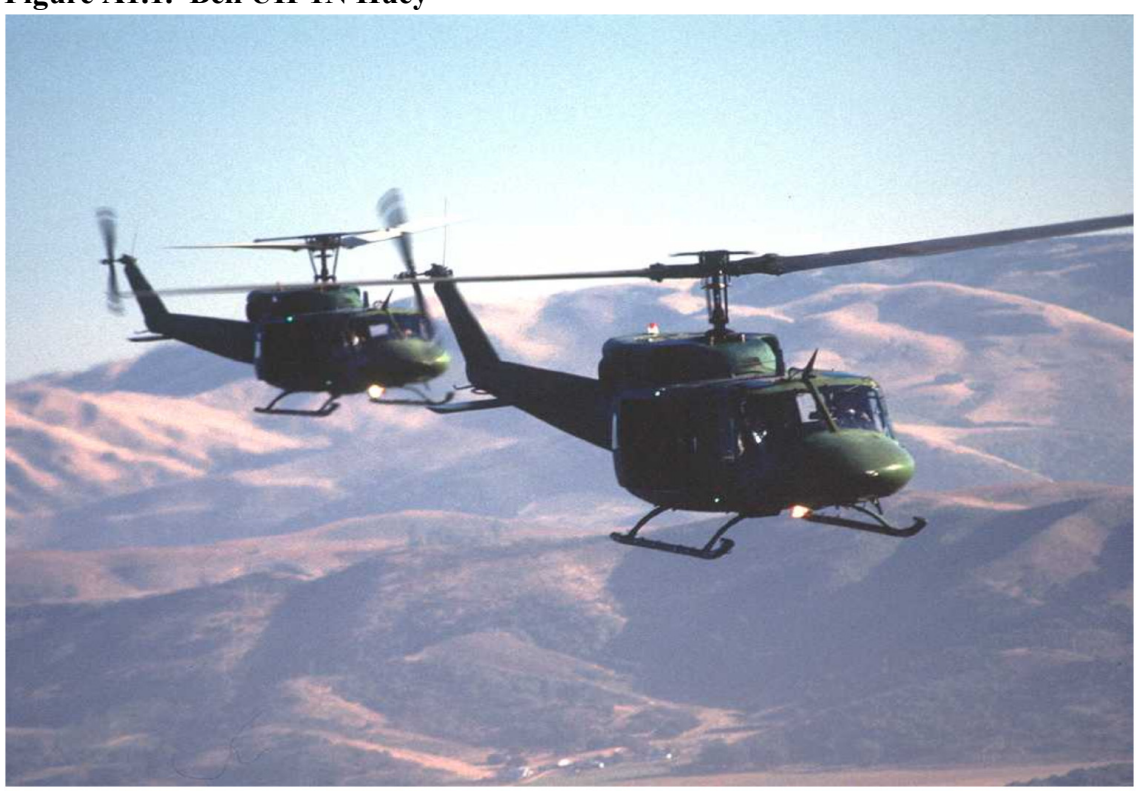
Figure A1.1. Bell UH-1N Huey